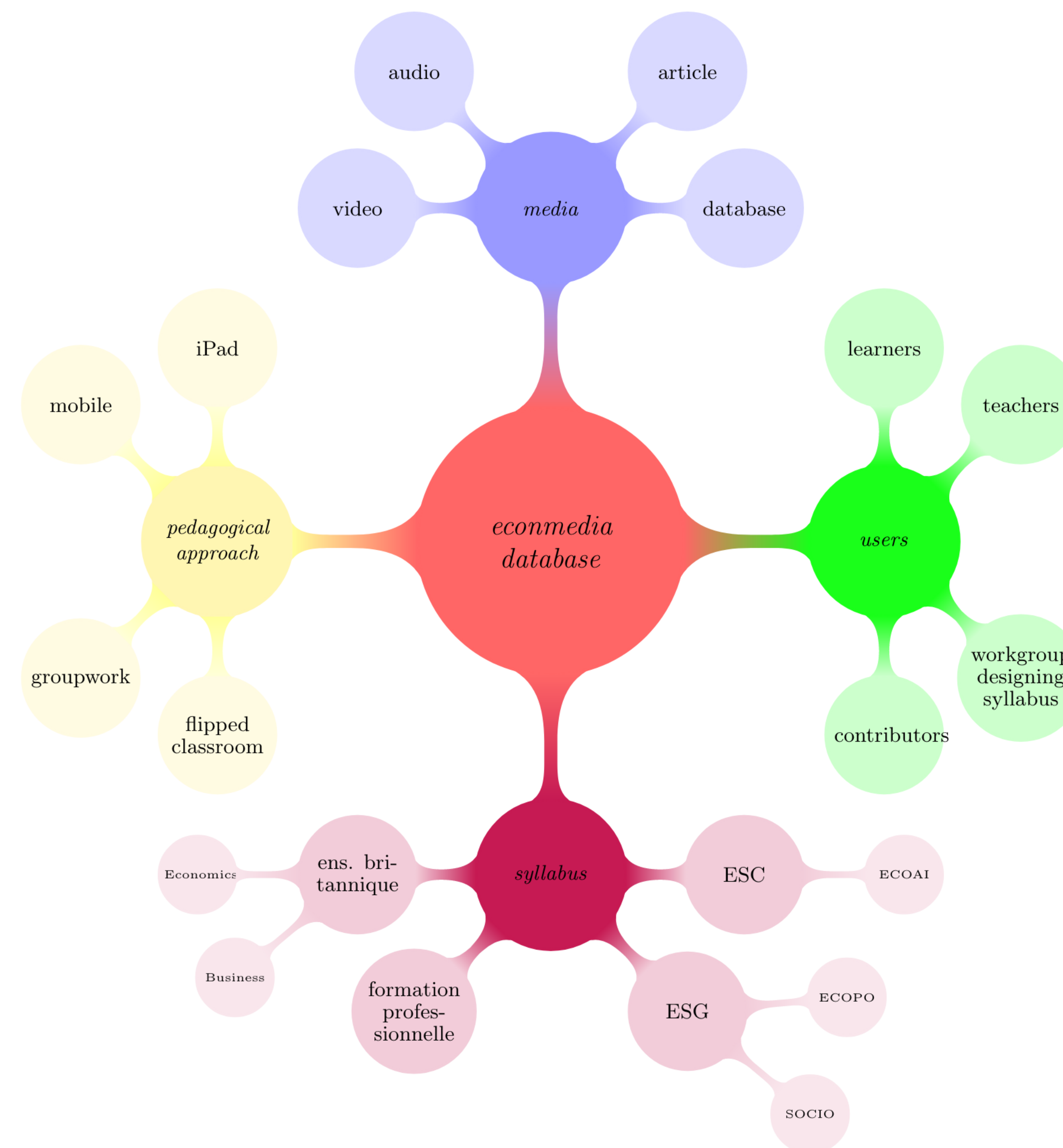
Fig. 1: Overview of the project.

This project can be used to implement a variety of pedagogical methods in the classroom. Relevant links can be shared with iPad classes. Articles can be used in group work. In general, all the material can be implemented in the flipped classroom approach [1, 4].